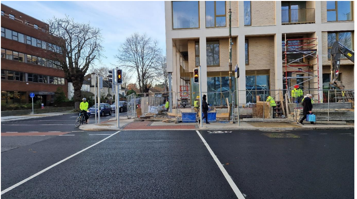
Image 7. As part of the Active Travel Network a new Toucan crossing was commissioned on Donnybrook Road.

Snagging works are well under way with commissioning expected early February 2024.